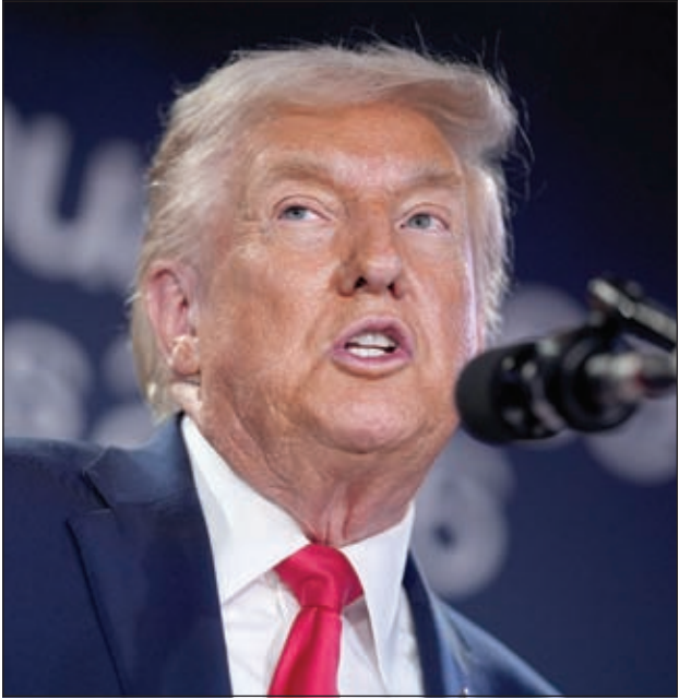
President Donald Trump speaks during a meeting of Global Business Leaders at the Annual Meeting of the World Economic Forum in Davos, Switzerland, Wednesday, Jan. 21, 2026.