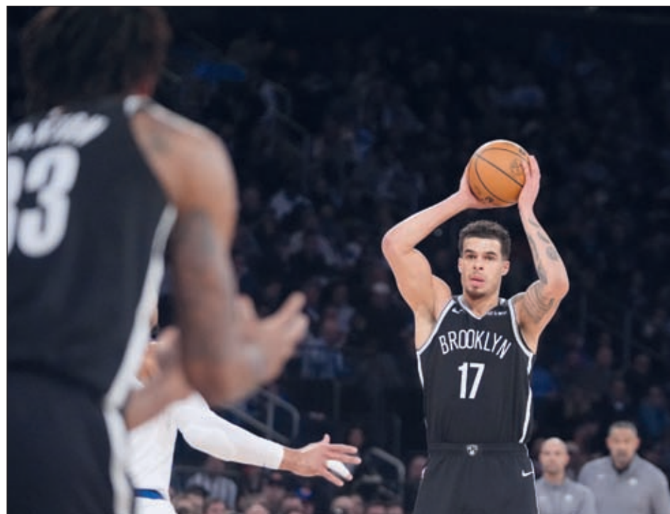
Michael Porter Jr. and the Nets tried to end their recent malaise when they hosted the Boston Celtics at Barclays Center on Friday night.