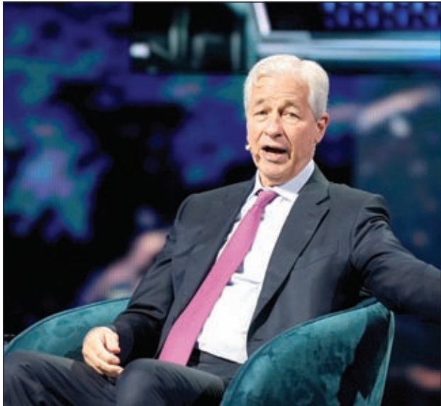
Jamie Dimon, CEO of JPMorgan Chase, speaks at the America Business Forum, Thursday, Nov. 6, 2025, in Miami.