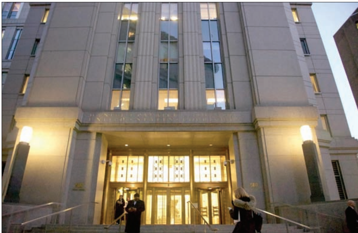
A Queens couple filed a federal lawsuit accusing the operators of a home for special needs adults of abusing their son.

"Our son went to Anderson Center for Autism because we believed it was a place of safety, expertise, and care. Instead, we learned through a whistleblower's video that he was subjected