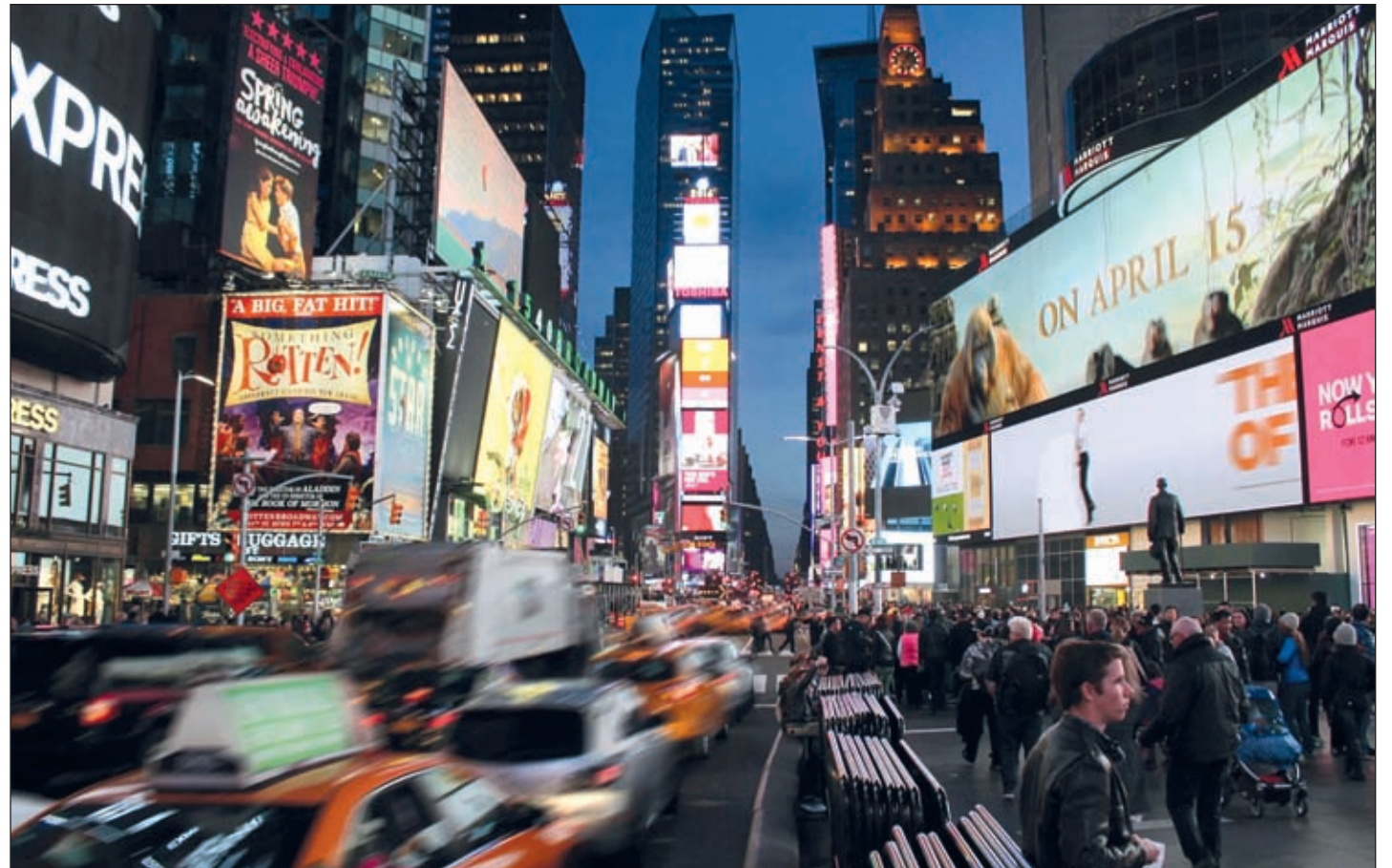
Eleven members of the Broadway League's board of governors donated a total of $121,000 in October.