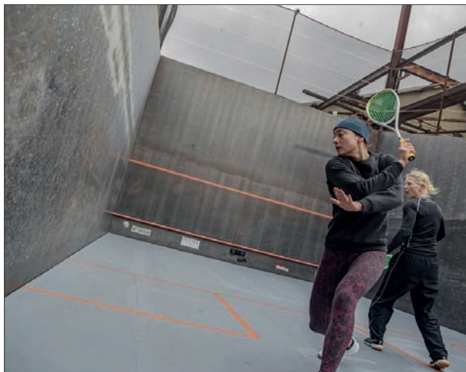
A top-tier squash tournament comes to Maspeth.

Seniors meet new friends and explore the magic