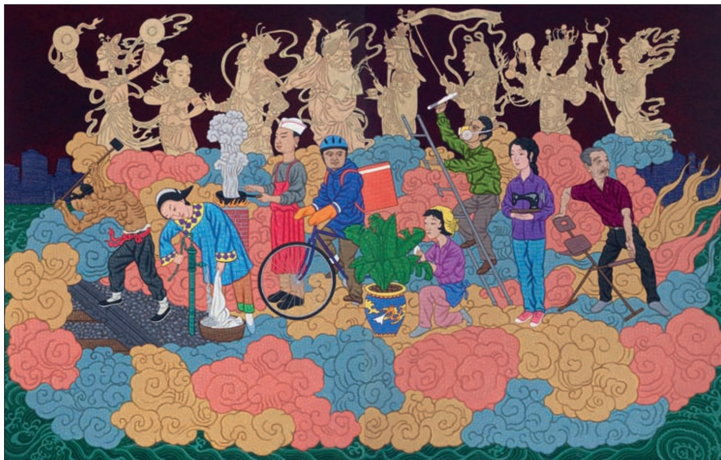
A group exhibition of 15 New York-based Asian artists opens at Flushing Town Hall on Friday.

Audiences watch dance works-in-progress and