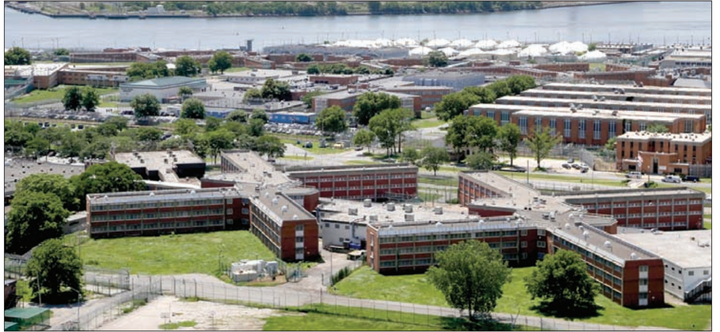
Fifteen people died in Department of Correction custody in 2025, the highest death toll since 2022 when 19 people died.