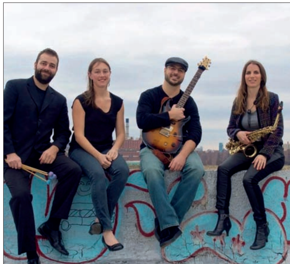
Hypercube, a NYC-based quartet comes to The Church-in-the-Gardens.