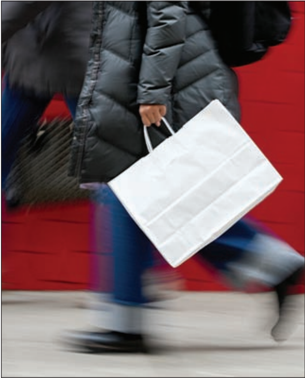
A person carries a shopping bag in Philadelphia, Wednesday, Dec. 10, 2025.